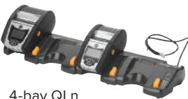
4-bay QLn Ethernet Cradle