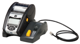
Single-bay QLn Ethernet Cradle

From Accessories, to Supplies, to Zebra OneCare Service