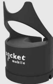
Charging Dock SKU# AC4133-1871