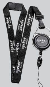
Lanyard - Black AC4100-1692