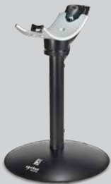
Charging Stand SKU# AC4076-1538