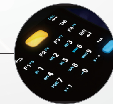
LED backlight keypad